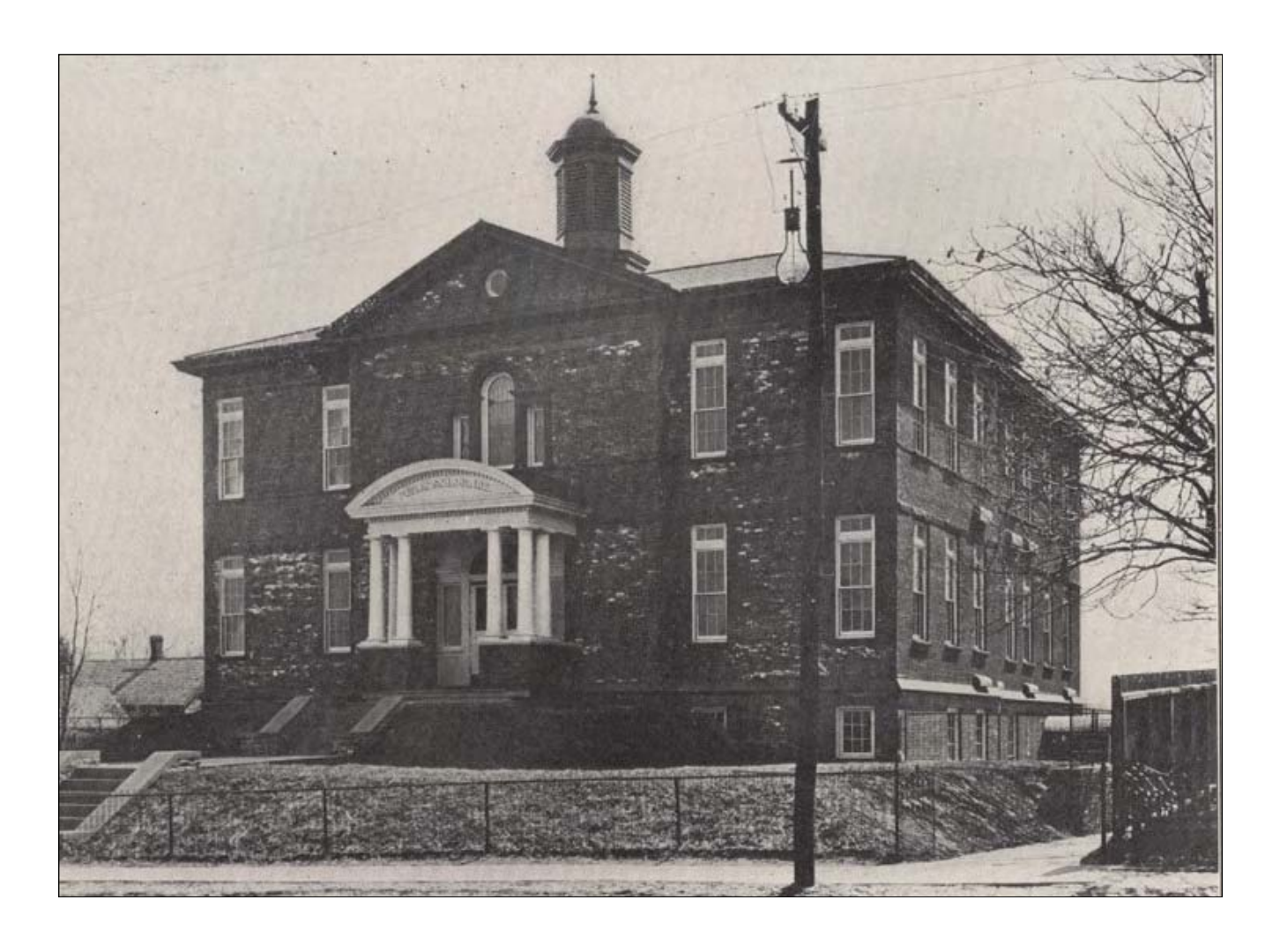
Public School 102 (later Public School 17 — The City Island School)