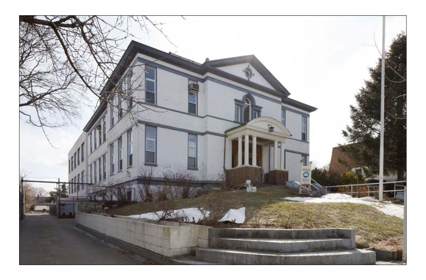
Public School 102 (later Public School 17 — The City Island School), 190 Fordham Street, the Bronx