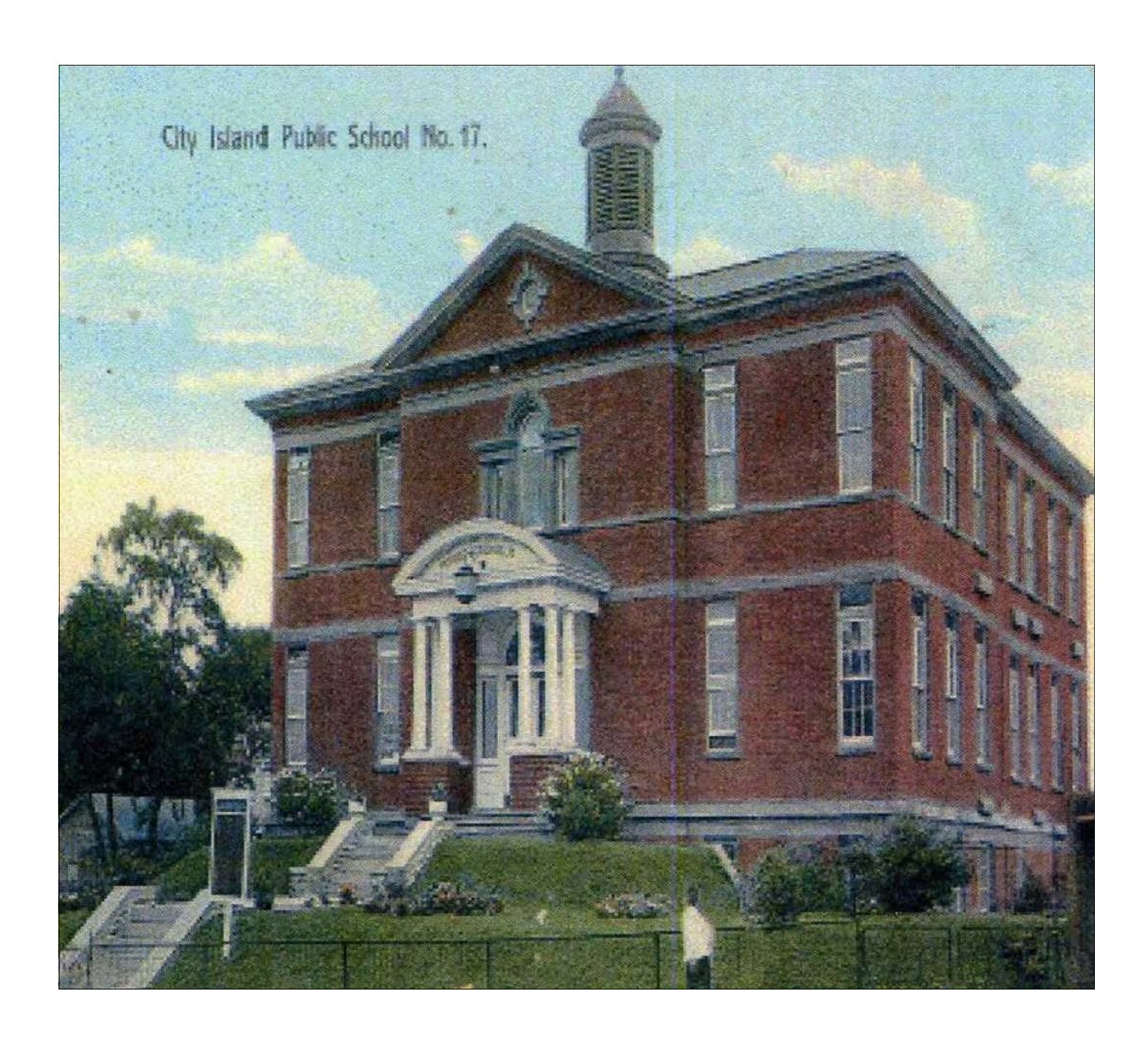
Public School 102 (later Public School 17 — The City Island School)