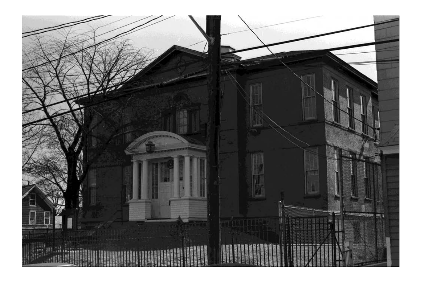
Public School 102 (later Public School 17 — The City Island School)